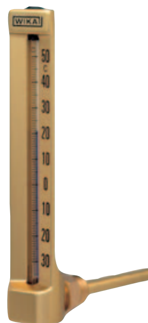
Machine glass thermometer model 32, 90° angle version