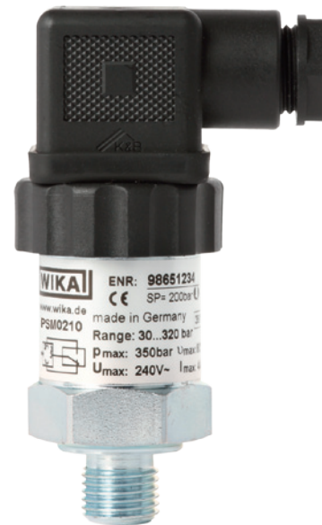
OEM compact pressure switch, with settable hysteresis, model PSM02

The high reproducibility of the switch point of \pm 2\% and the settability of the hysteresis makes the model PSM02 pressure switches interesting for all customers who place a value on precision as well as an attractive price.